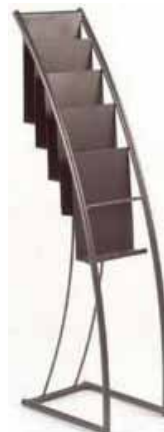
Display Pad (L101xD43XH110)

All furniture orders are made by organization.