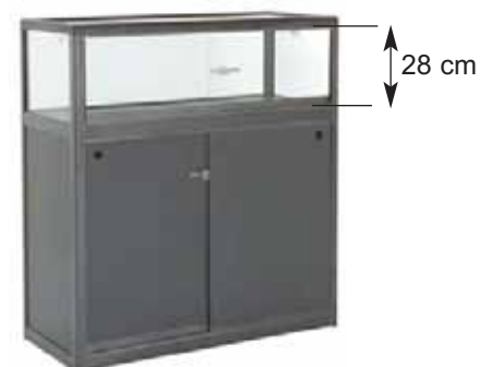
Showcase CV (L27xD35xH120)